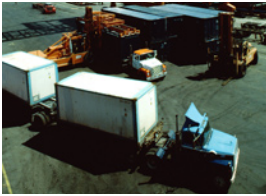
Port Management - truck based