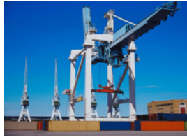
Port Management - Crane based