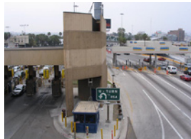
Border Crossings Access and Gate Control Systems