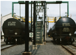
Rail Cargo Installation