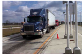
Mobile Inventory Systems Weigh-in Stations